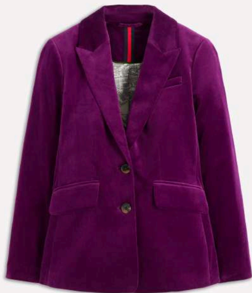
Classic Boyfriend Blazer $120.00